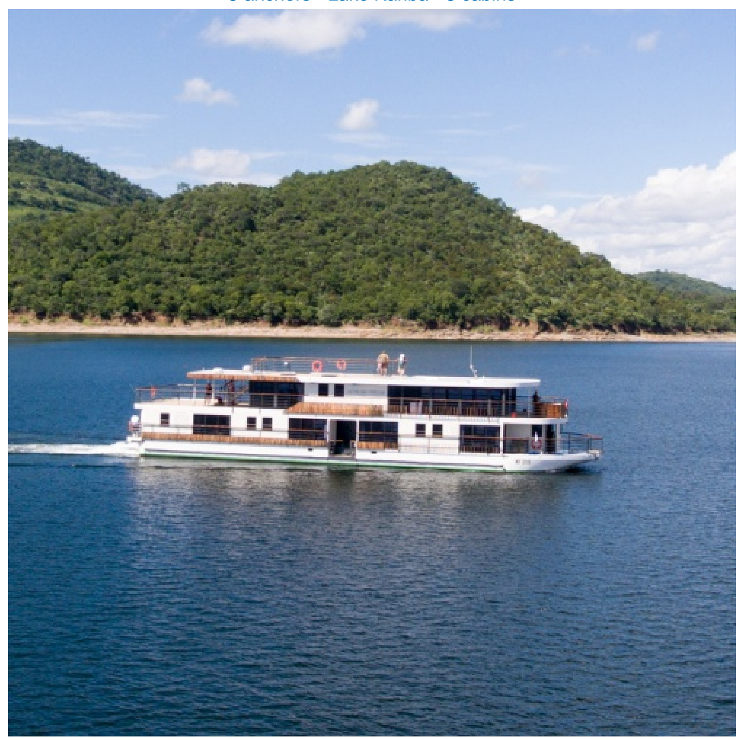
5 anchors - Lake Kariba - 8 cabins